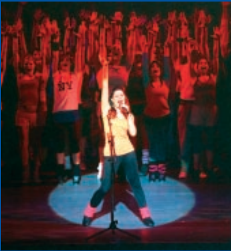
Fame, title number in concert

Amateur Stage has followed Glasgow's Apollo Players from four productions of Fame through to the World Premiere of the sequel, Fame Forever, in May. However, the English Premiere this month has gone one better, thanks to the Rattonians in Eastbourne.